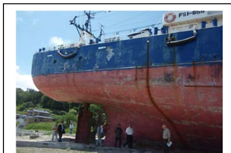
Tohoku Study Tour

Congratulations on the issue of the IISEE Newsletter No. 100.