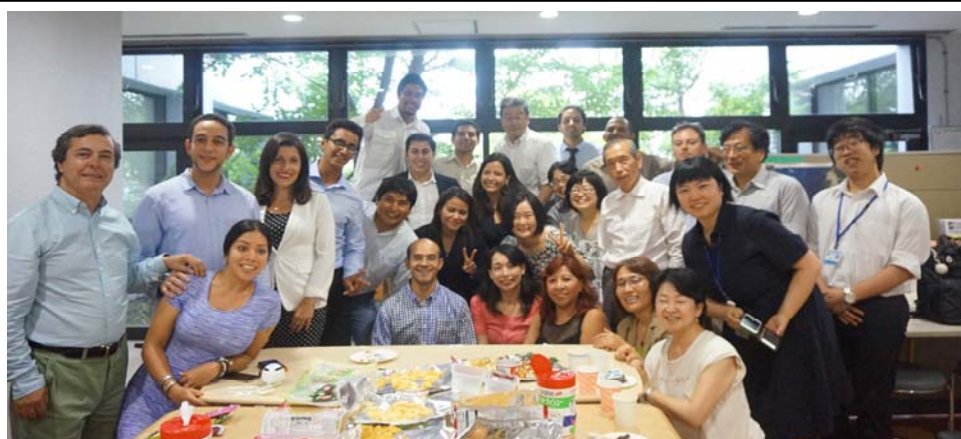
Group photo at Friendship Party