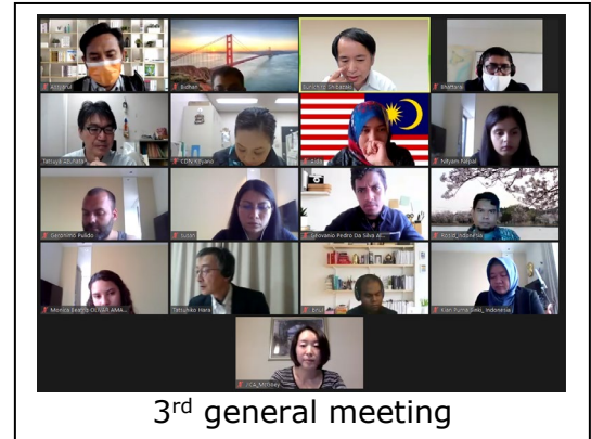
3 rd general meeting

With the group training coming to an end, we held the third general meeting on 14 May. At this meeting, the participants and IISEE, and JICA staff gathered together to discuss the improvement of the training. Due to the COVID-19, we mainly conducted this year's training through remote lectures. There were concerns about whether the training was satisfactory or not, but the feedback from the trainees was quite positive. However, someone said that they did not have enough time to understand the content of the lectures and that there were not enough opportunities for onsite training. There is still time for individual study, etc. IISEE will do its best to meet the needs of the participants within the remaining training period.